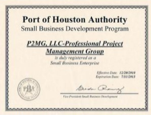
Port of Houston Authority Small Business Development Program