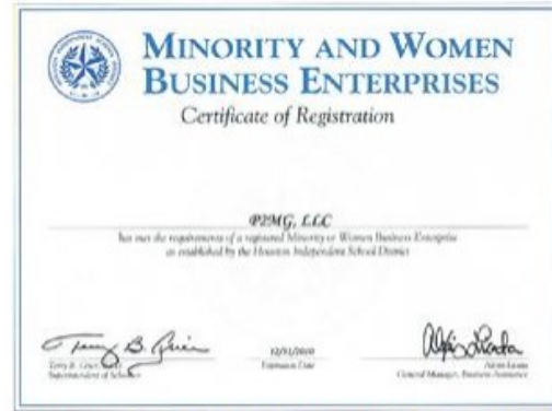
Houston Independent School District Minority and Women Business Enterprises