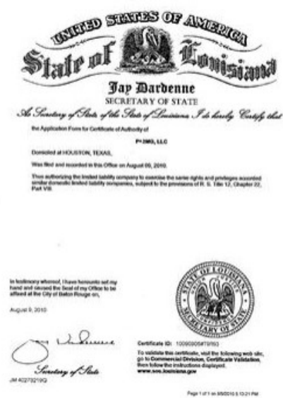
State of Louisiana Certification