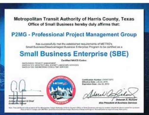
METRO Small Business Program