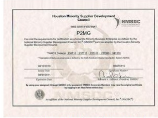
Houston Minority Supplier Development Council